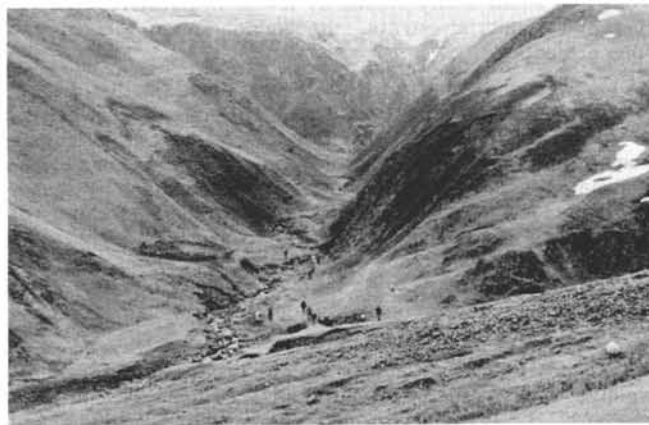
Figure 1: General view of the Dob's Linn area, near Moffat, Scotland.

A factor in favour of the acuminatus Biozone was that this placed the Ordovician-Silurian boundary clearly above the widespread and distinctive Late Ordovician Hirnantia shelly fauna. Although most of this fauna is confined to pre- persculptus Biozone strata, in the last ten years it has become clear that some developments of the Hirnantia fauna, such as those occurring in Kazakhstan, Tasmania, and the English Lake District, extend upwards into rocks of persculptus Biozone age. Thus their clear-cut allocation to the Ordovician rather than to the Silurian, or spanning the boundary, has been welcomed by many scientists.